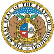
Exhibit revised by Amendment #01

STATE OF MISSOURI OFFICE OF ADMINISTRATION DIVISION OF PURCHASING (PURCHASING) REQUEST FOR PROPOSAL (RFP)